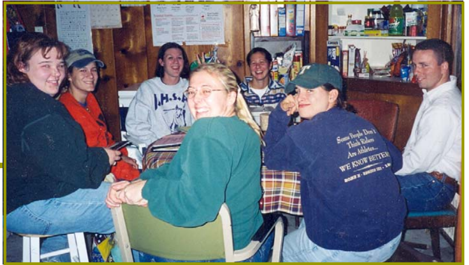
Partying like it's 1999!

How many of these Truman Alumni can you name? (answers at bottom of page)